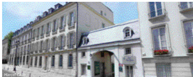
Residence Marcel Callo